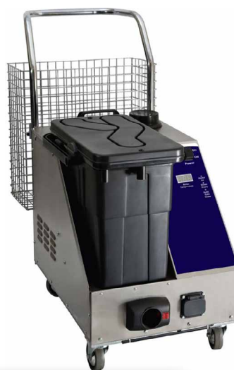
Industrial steamer Steamex SV4

COST ON APPLICATION see reverse for details